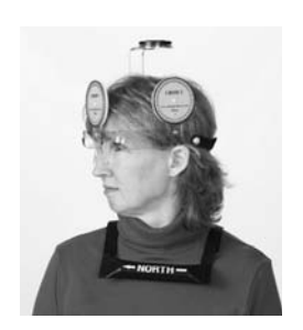
Figure 12: Right rotation

*You can find magnetic (map) north by noting the direction of the red needle on the rotation meter when it is at least four feet from the magnetic yoke.