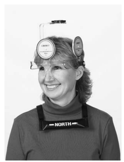
Figure 1: CROM 3 with rotation arm and magnetic yoke

Rounded shoulder is the anterior movement of the scapula (shoulder and upper extremity) on the thorax. Rounded shoulder measurements are taken with the tape measure .