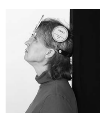
Figure 5: Extension