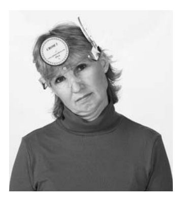
Figure 9: Right lateral flexion