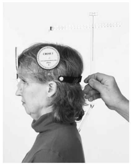
Figure 2: CROM 3 with forward head arm and vertebra locator