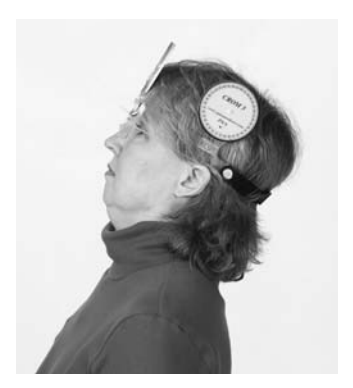
Figure 7: Cervical extension