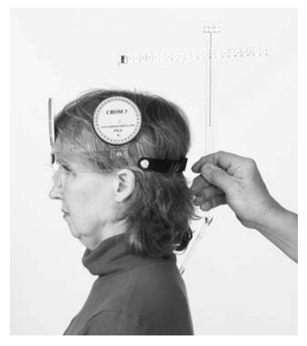
Figure 13: CROM 3 with forward head arm and vertebra locator

Then, instruct the subject to protract or protrude the head forward as much as possible, while keeping the chin level. Record this measurement as protraction.