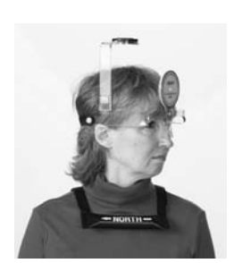
Figure 11: Left rotation

Instruct the subject to focus on a horizontal line on the wall so the head is not tipped during rotation. Have the subject turn the head as far to the left as possible (see figure 11), and to ensure that no shoulder rotation occurs, lightly stabilize the right shoulder with your hand. (Note: if the head and shoulders are rotated together the pointer will not move because the magnetic yoke positioned on the shoulders eliminates shoulder substitution). Record this measurement in the appropriate place on the recording sheet.