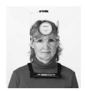
Figure 10: Magnetic yoke pointing north

Next, place the magnetic yoke on the subject's shoulders with the arrow pointing north (see figure 10). Instruct the subject to sit erect in a straight-back chair with the sacrum against the back of the chair, the thoracic spine away from the back of the chair, arms hanging at sides and feet flat on the floor. The lateral flexion and sagittal plane meters must read zero for the rotation meter to be level; if necessary, assist the subject into the correct position. As the subject faces straight ahead, grasp the rotation meter between your thumb and index finger and turn the meter until one of the pointers is at zero.