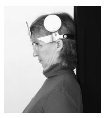
Figure 4: Flexion