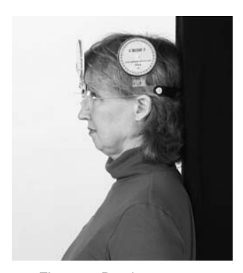
Figure 3: Resting posture

* A sample recording sheet is provided in the back of this manual. Tablets of the recording sheet may be ordered from your dealer as PAA Form 101.